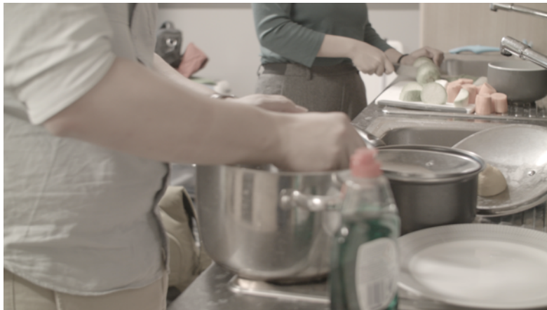
Screenshot from an interview with two core members

The first initial research was conducted in London in October 2018 with Decoding Hong Kong's History , an initiative that studies previous confidential files on foreign governments' policy on handover. The research includes a series of interviews and fieldwork with the Hong Kong team and London volunteers. The interview would be consciously including people of diverse backgrounds, for instance people who have been working with the archives for over two years, as well as new volunteers who are less familiar with the content of these material.